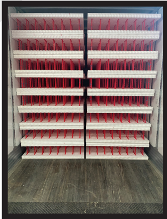
Tied Packaging 1 bundle weights 20 lbs