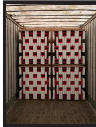
Cardboard packaging 1 bundle weights 80 lbs

ICF comes in 2 options; Tied or cardboard. Each option takes roughly an hour to unload with 2-4 helpers.